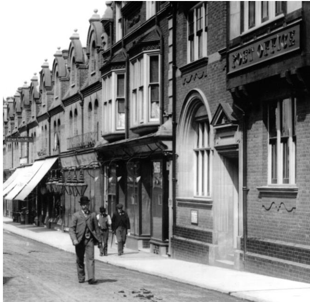
Figure 5. Post office 1898

In the late 1950s, the old Council Office building was demolished and the new home for the central post office was built on the site, fronting on to what became Market Square. The new post office opened on 6th April 1960.