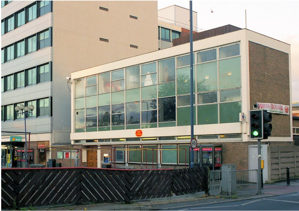
Figure 7. Post office 1999

The Market Square office closed in 2008 and the post office moved into the W H Smith's store in Wolsey Place. The Market Square building was demolished in 2015, prior to the Victoria Square development.