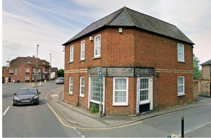
Figure 1. Site today of post office in 1864

The post office was removed to the High Street in Woking Village (opposite the White Hart, where No. 177 now is) 1 in 1864. The mail now came by train to Woking Station and was sorted for distribution in the post office. The following year a sub-post office was built near to Woking Station, at No. 1 High Street where the NatWest Bank now is. In 1869, James Mansell moved to the post office at Woking Station.