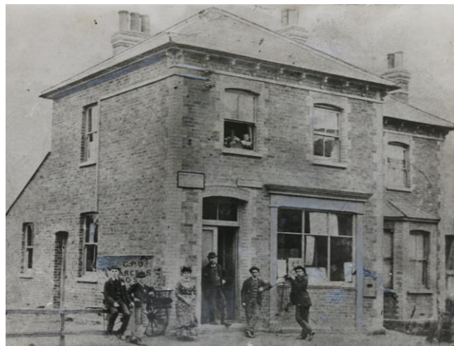
Figure 2. New post office