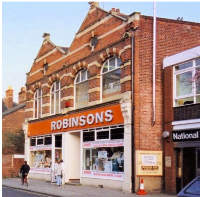
Figure 6. Temporary site of post office