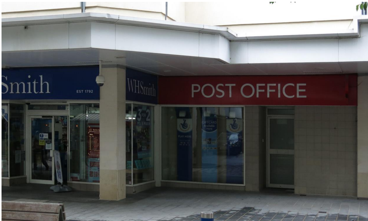
Figure 8. Post office 2001

The Market Square office closed in 2008 and the post office moved into the W H Smith's store in Wolsey Place. The Market Square building was demolished in 2015, prior to the Victoria Square development.