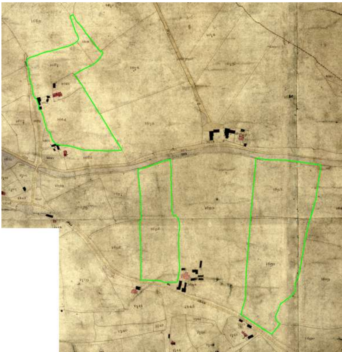
Woking tithe map, 1840