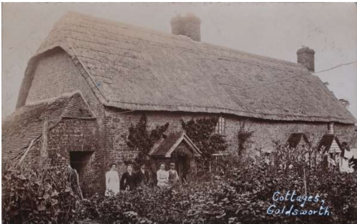
Norley Cottages (formerly Goldworth Farm) c.1910 9

The cottages were also later recorded with names Goldsworth Bridge Cottages and Langman's Cottages.