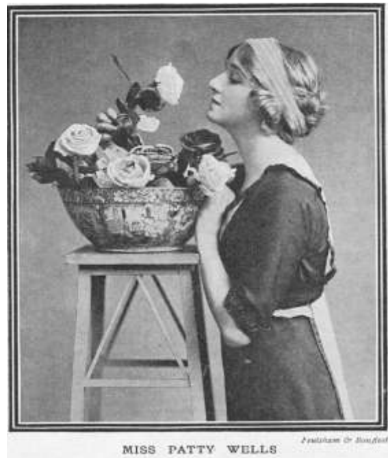
Pictured in Tatler , 1911

She was often featured on postcards as a "pretty stage actress".