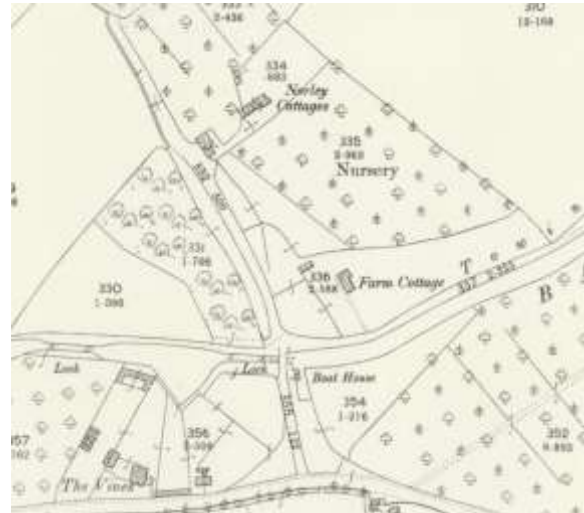
1895 OS Plan

Initially known as Goldworth Farm Cottages, on the 1895 OS plan, the cottages are recorded as Norley Cottages. They were then surrounded by Walter Slocock's Goldsworth Nursery.