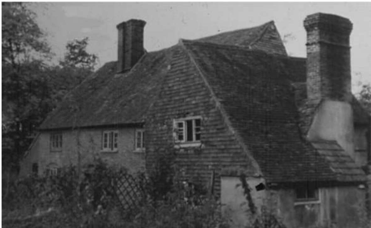
Langman's Cottages The earlier thatched roof has been replaced with tiles

Goldsworth Farm Cottages aka Norley Cottages aka Langman's Cottages were demolished in about 1968. After Oliver Slocock's death in 1970, the nursery was sold for development. The site is currently covered by the houses of Fenwick Close, Goldsworth Park (No.s 22-24).