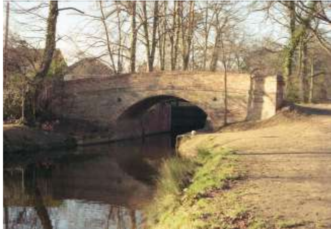
Langman's Bridge, 1986

In the 1790s, the Basingstoke Canal was constructed across Woking Common. Thereafter, the farm was accessed via a brick arch bridge, built across the canal, named Goldsworth Bridge. Now known as Langman's Bridge, it is one of only two of the original canal bridges which still exist within the Woking area - the other being Woodend Bridge. Both are scheduled ancient monuments.