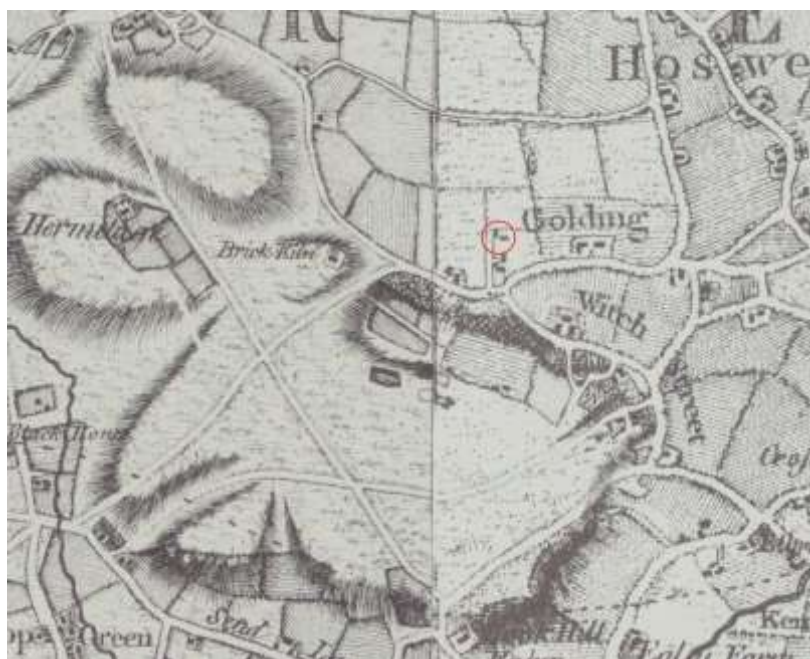
From John Rocque's 1768 map of Surrey