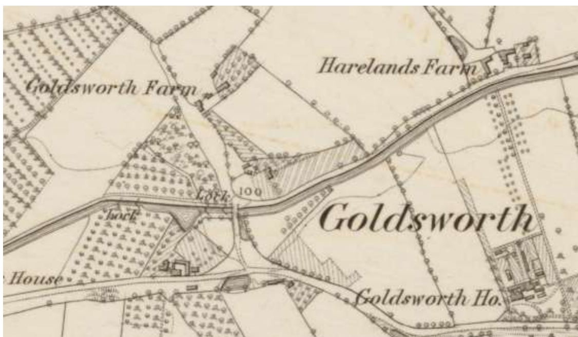
OS map, 1871